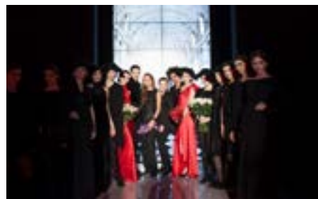
4 November, Central Exhibition Hall "Manege", Isaakiyevskaya sq., 1