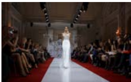
November 16-19, 16:00-22:00 Hotel Hilton St. Petersburg ExpoForum

Lush and straight, long and short, playful and modest, classical and avant-garde, white and not only - at the Wedding Fashion Week Russian designers will present a variety of dresses for brides. In total, the guests will see 16 unique collections.