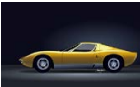
Mon, Wed-Sun 10:00-22:00 Erarta. Modern Art Museum. 29 line VO, 2 Exhibition: "Lamborghini: Design Legend" The new exhibition space of Erarta opens with the exhibition "Lamborghini: the legend of design".

12th of November at 20:00 "Zal Ozhidaniya" concert club (118 Obvodnogo kanala embankment) The world has become acquainted with Chrysta Bell in the 3rd season of the TV series "Twin Peaks" where she played FBI agent Tamara Preston, the investigation partner of David Lynch's character himself. The singer has prepared a program with bright visuals and mysterious tracks for her show. Get yourself a cup of strong coffee and learn how to talk backwards in order to truly appreciate Chrysta Bell's magic.